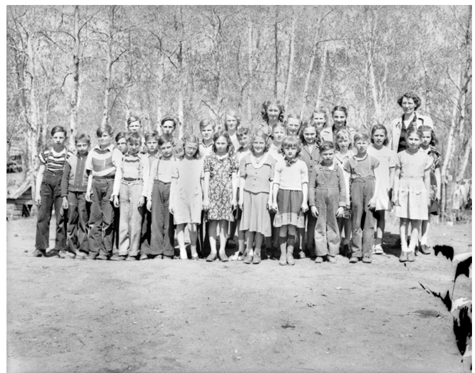
G749B, Junior Room Kotzman School, 1948

Accession: PR1970.0422, PR1971.0118, PR1971.0133, PR1972.0284, PR1973.0363, PR1973.0364, PR1973.0598, PR1973.0599, PR1973.0600, PR1973.0601, PR1973.0602, PR1973.0603, PR1973.0604, PR1973.0605, PR1973.0606, PR1973.0607, PR1973.0611