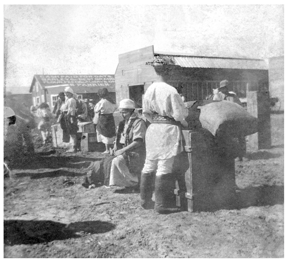
Settlers arriving at Canadian Pacific Railway Station, Edmonton, ca. 1900

Ukrainians have been a significant piece of the Alberta mosaic since the late 1800s. The mass immigration of Ukrainians to the west served as a catalyst for the formation of the province and its rapid development in the years to come.