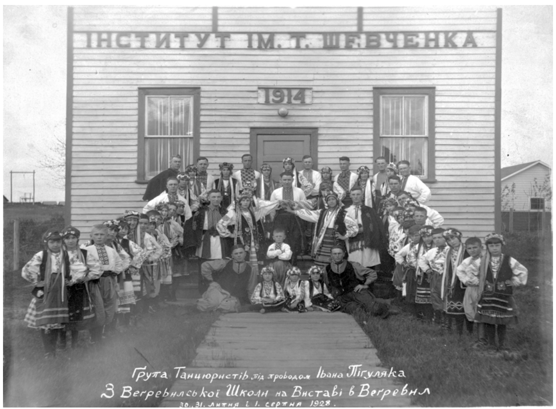
First Ukrainian School of Dance, Vegreville, 1928