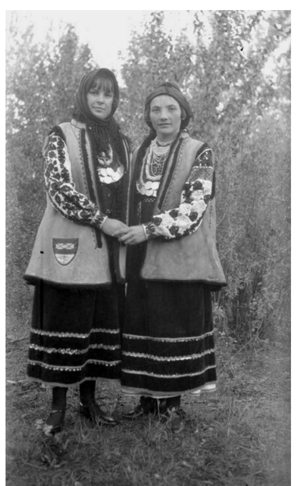
Provincial Archives of Alberta: G354, Women in Ukrainian Costume, Smoky Lake, [ca. 1935]