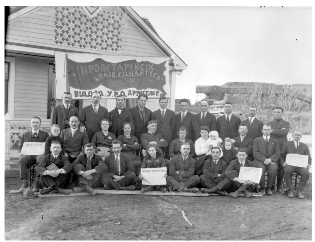
Group of people in front of the Ukrainian Hall, [Drumheller], 1920