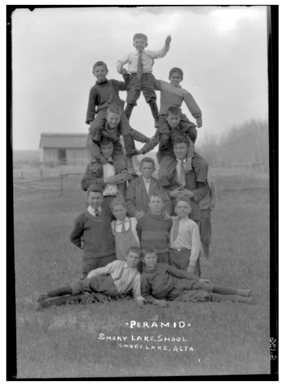
Human pyramid, Smoky Lake High School, [ca. 1927]