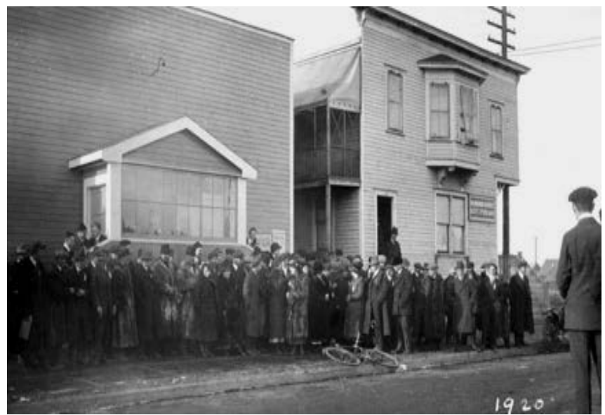
Provincial Archives of Alberta: G5, Ukrainian Institute (M. Hrushevsky), Edmonton, 1920