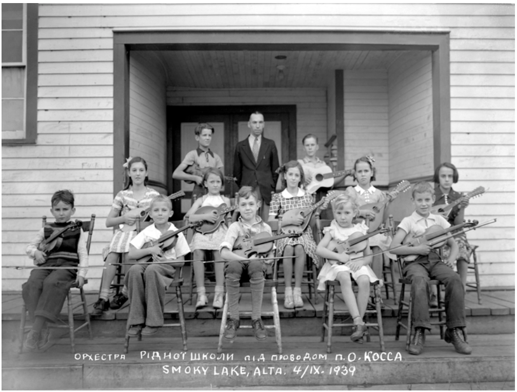
Provincial Archives of Alberta: G430, Students of the Ukrainian School, Smoky Lake, 1939