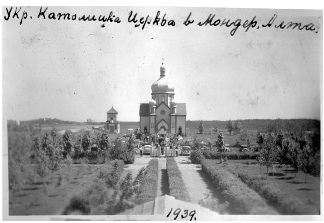
Provincial Archives of Alberta: A10061, Ukrainian Catholic Church, Mundare, 1939

Accession: PR2004.0573, PR2010.0645, PR2010.0646