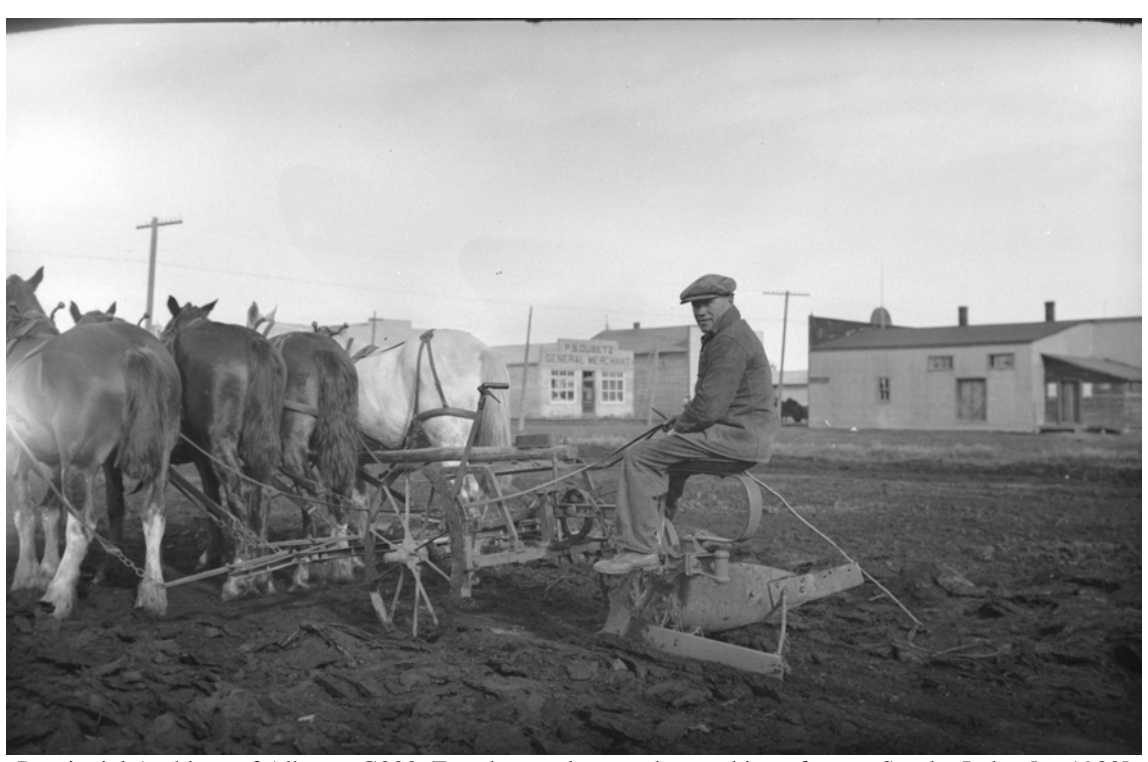
Provincial Archives of Alberta: G222, Four horse plow on the outskirts of town, Smoky Lake, [ca 1930]