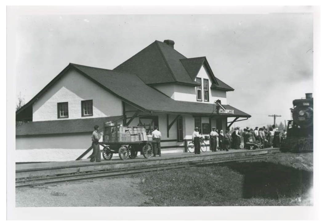
G297, Train station, Smoky Lake, 1936.

In institutional terms, the contemporary Ukrainian community in Alberta is represented by numerous cultural, educational and political organizations. Among these are Ukrainian Greek Orthodox and Ukrainian Catholic parishes and affiliated organizations, the system of Ukrainian bilinguals schools, Ukrainian youth organizations – Ukrainian Youth Association of Canada (CYM) and Plast, the Ukrainian Canadian Congress, which serves as an umbrella organization, Ukrainian women's associations – Ukrainian Catholic Women's League of Canada and Ukrainian Women's Association of Canada, Ukrainian Museum of Canada (Alberta Branch), Alberta Council for the Ukrainian Arts, the Canadian Institute for Ukrainian Studies, the Kule Centre for Ukrainian and Canadian Folklore, Ukrainian Canadian Archives and Museum, and the Ukrainian Cultural Heritage Village, Historic Sites Branch, Heritage Division in the Ministry of Culture and Community Spirit. Alberta is also home to many dance ensembles, choirs, organizations and one of the largest Ukrainian festivals in Canada – the Pysanka Festival in Vegreville.