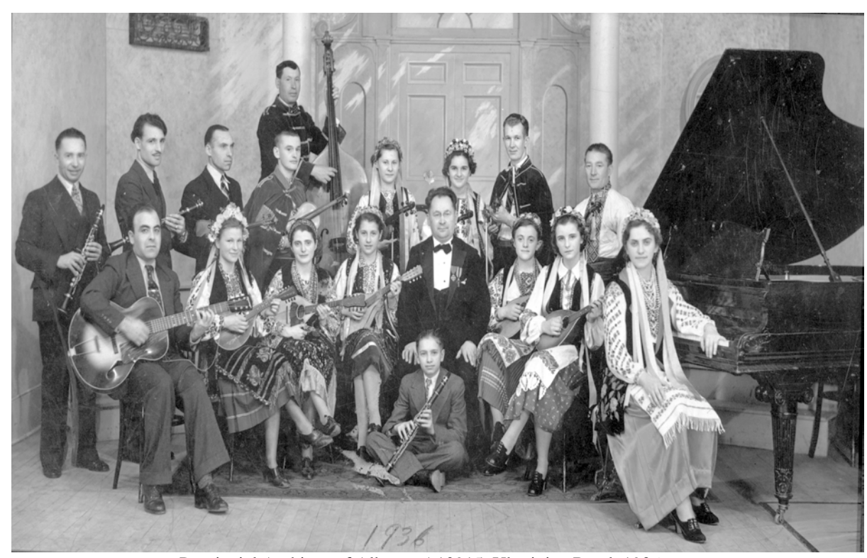
Provincial Archives of Alberta: A10915, Ukrainian Band, 1936

Accession: PR1971.0214, PR1972.0400, PR2000.1309