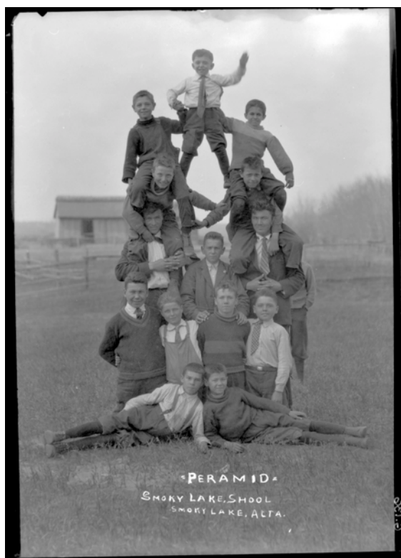
Human pyramid, Smoky Lake High School, [ca. 1927]