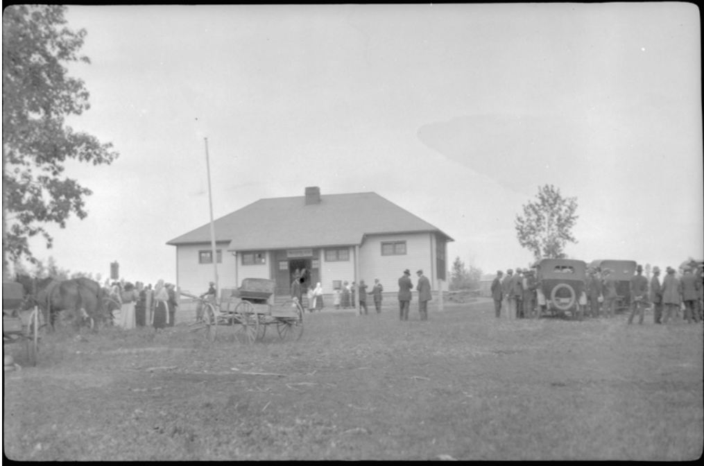
Church meeting in schoolhouse, Radway, [ca. 1925-1927]