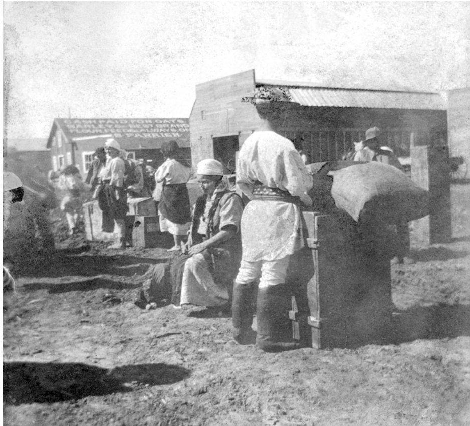
Settlers arriving at Canadian Pacific Railway Station, Edmonton, ca. 1900

Ukrainians have been a significant piece of the Alberta mosaic since the late 1800s. The mass immigration of Ukrainians to the west served as a catalyst for the formation of the province and its rapid development in the years to come.