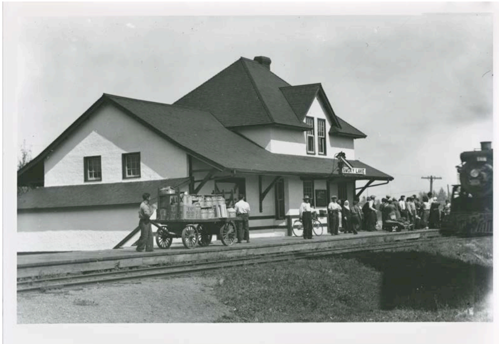
G297, Train station, Smoky Lake, 1936.

In institutional terms, the contemporary Ukrainian community in Alberta is represented by numerous cultural, educational and political organizations. Among these are Ukrainian Greek Orthodox and Ukrainian Catholic parishes and affiliated organizations, the system of Ukrainian bilingual schools, Ukrainian youth organizations – Ukrainian Youth Association of Canada (CYM) and Plast, the Ukrainian Canadian Congress, which serves as an umbrella organization, Ukrainian women’s associations – Ukrainian Catholic Women’s League of Canada and Ukrainian Women’s Association of Canada, Ukrainian Museum of Canada (Alberta Branch), Alberta Council for the Ukrainian Arts, the Canadian Institute for Ukrainian Studies, the Kule Centre for Ukrainian and Canadian Folklore, Ukrainian Canadian Archives and Museum, and the Ukrainian Cultural Heritage Village, Historic Sites Branch, Heritage Division in the Ministry of Culture and Community Spirit. Alberta is also home to many dance ensembles, choirs, organizations and one of the largest Ukrainian festivals in Canada – the Pysanka Festival in Vegreville.