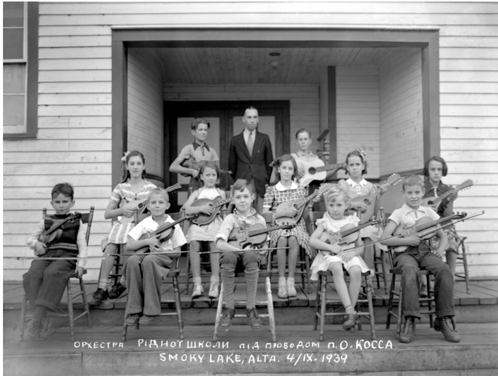
Provincial Archives of Alberta: G430, Students of the Ukrainian School, Smoky Lake, 1939