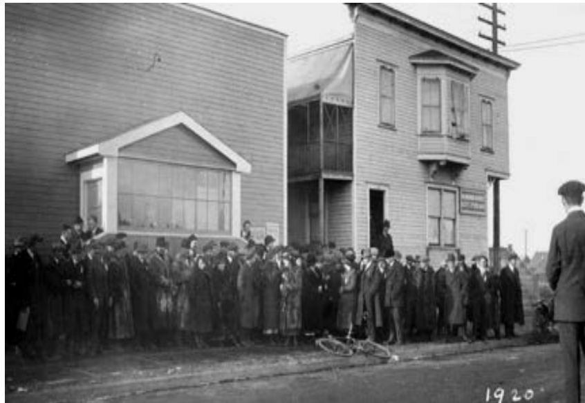
G5, Ukrainian Institute (M. Hrushevsky), Edmonton, 1920