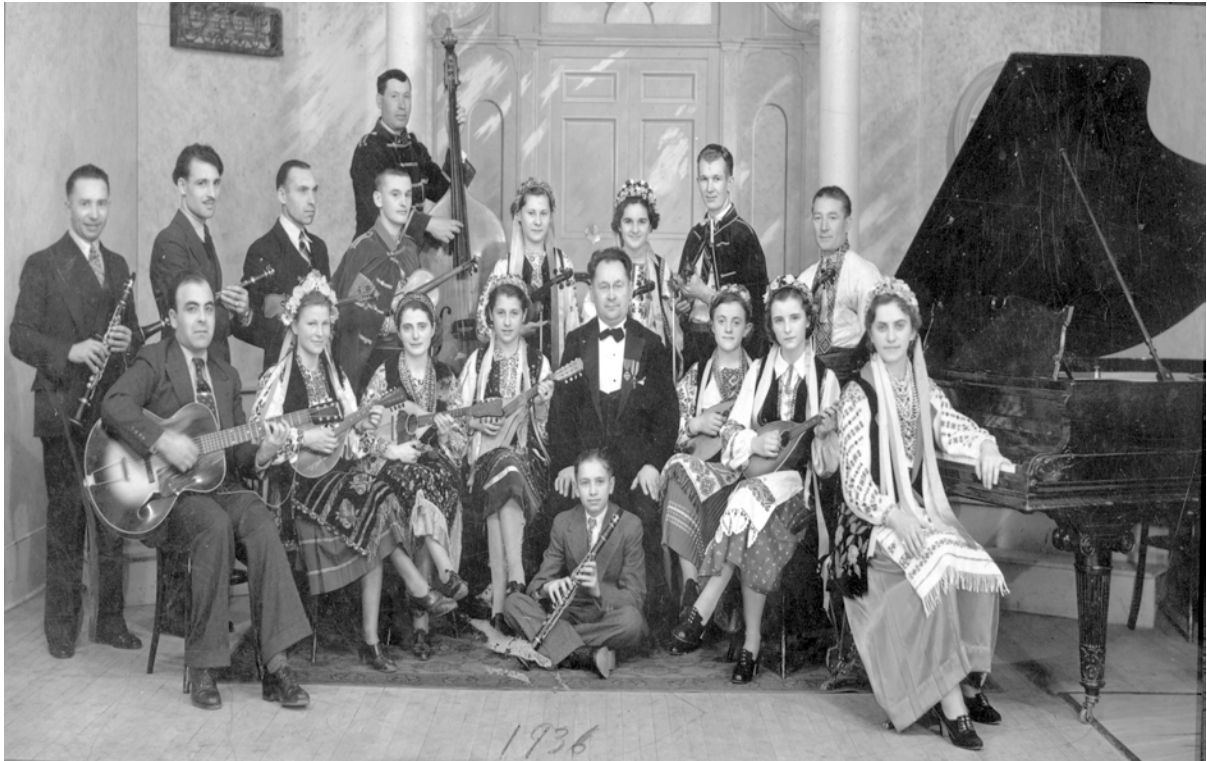
A10915, Ukrainian Band, 1936

Accession: PR1971.0214, PR1972.0400, PR2000.1309