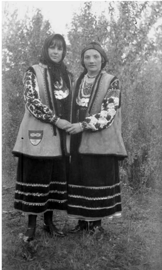
Provincial Archives of Alberta: G354, Women in Ukrainian Costume, Smoky Lake, [ca. 1935]