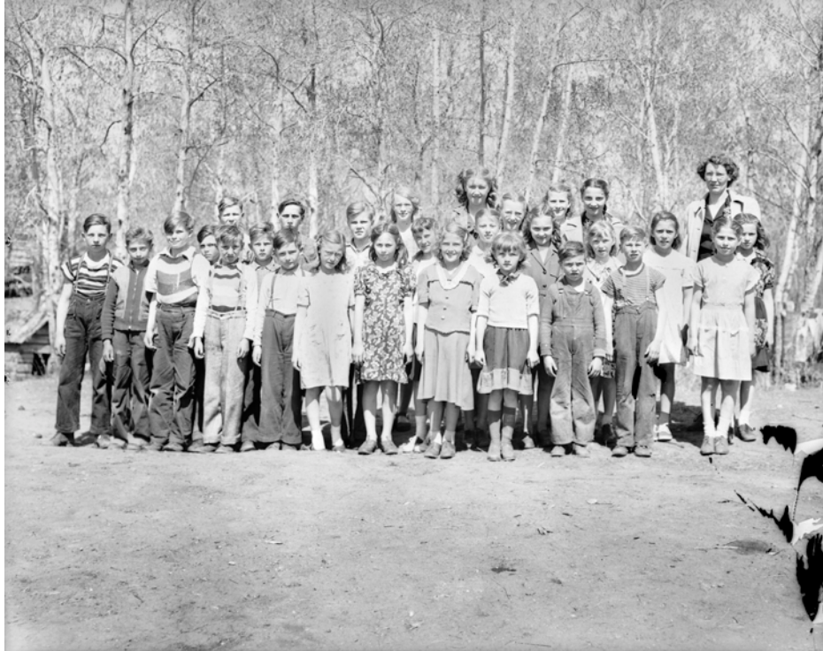
G749B, Junior Room Kotzman School, 1948

Accession: PR1970.0422, PR1971.0118, PR1971.0133, PR1972.0284, PR1973.0363, PR1973.0364, PR1973.0598, PR1973.0599, PR1973.0600, PR1973.0601, PR1973.0602, PR1973.0603, PR1973.0604, PR1973.0605, PR1973.0606, PR1973.0607, PR1973.0611