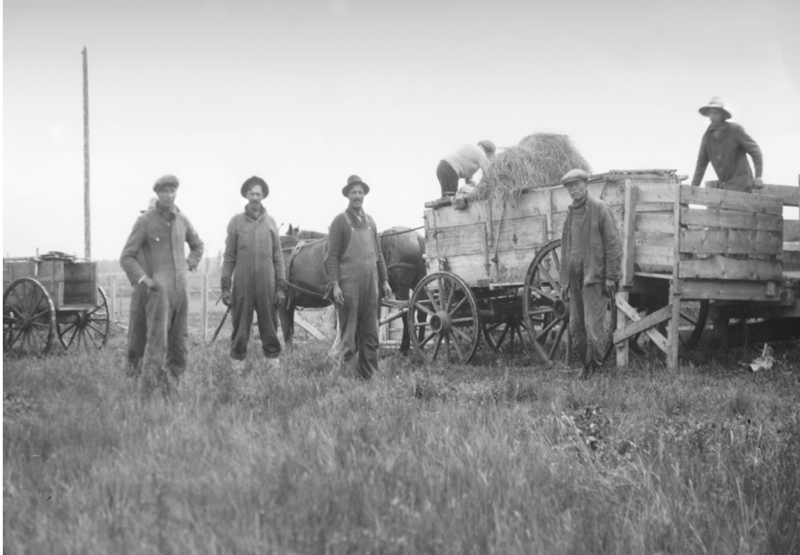
Farmers and hay wagon, Smoky Lake, [ca 1925-1933]