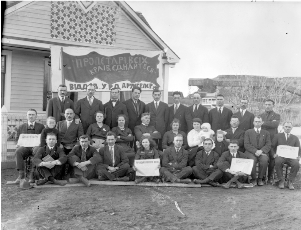
Group of people in front of the Ukrainian Hall, [Drumheller], 1920