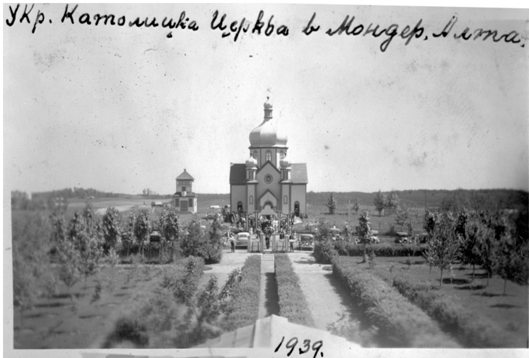
Provincial Archives of Alberta: A10061, Ukrainian Catholic Church, Mundare, 1939

Accession: PR2004.0573, PR2010.0645, PR2010.0646