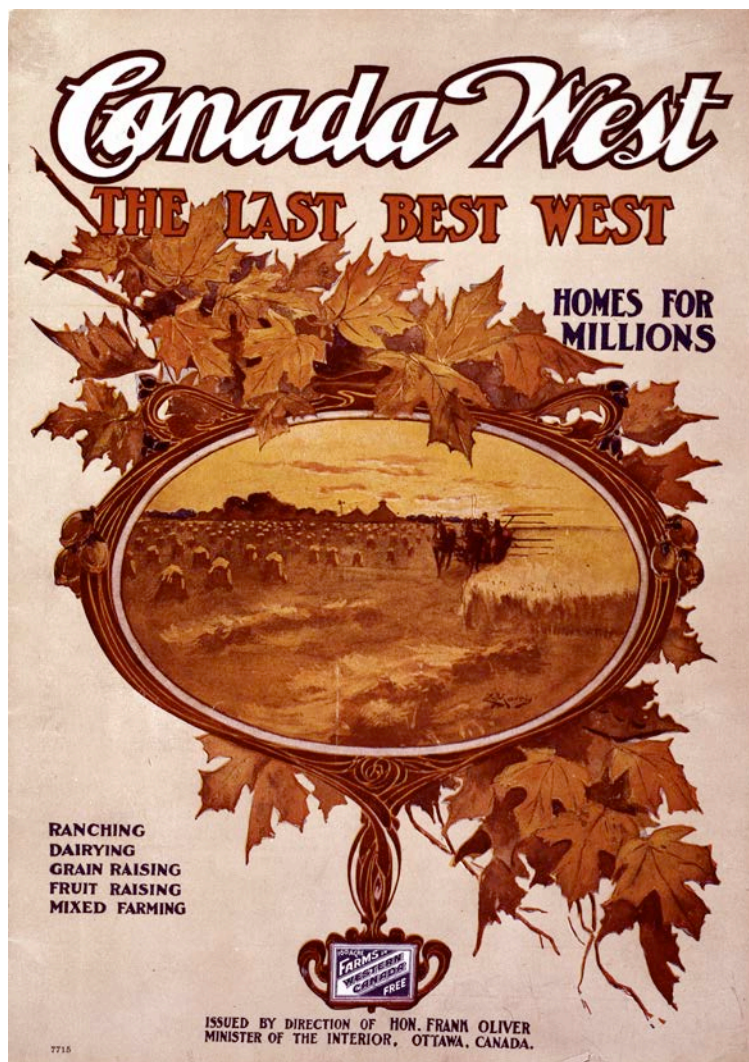
"Canada West – The Last Best West" Magazine cover, encouraging immigration to western Canada, 1905-1911