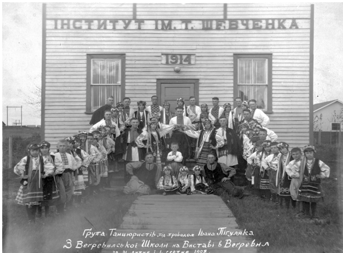
First Ukrainian School of Dance, Vegreville, 1928