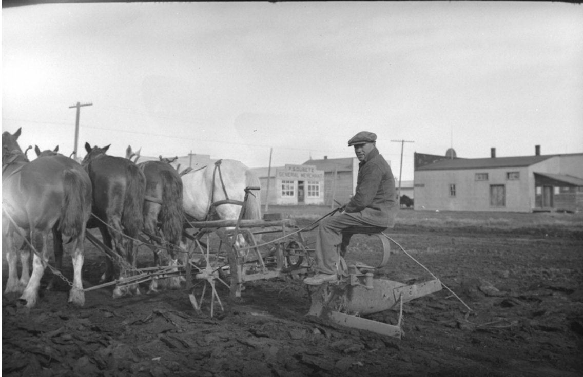
Provincial Archives of Alberta: G222, Four horse plow on the outskirts of town, Smoky Lake, [ca 1930]