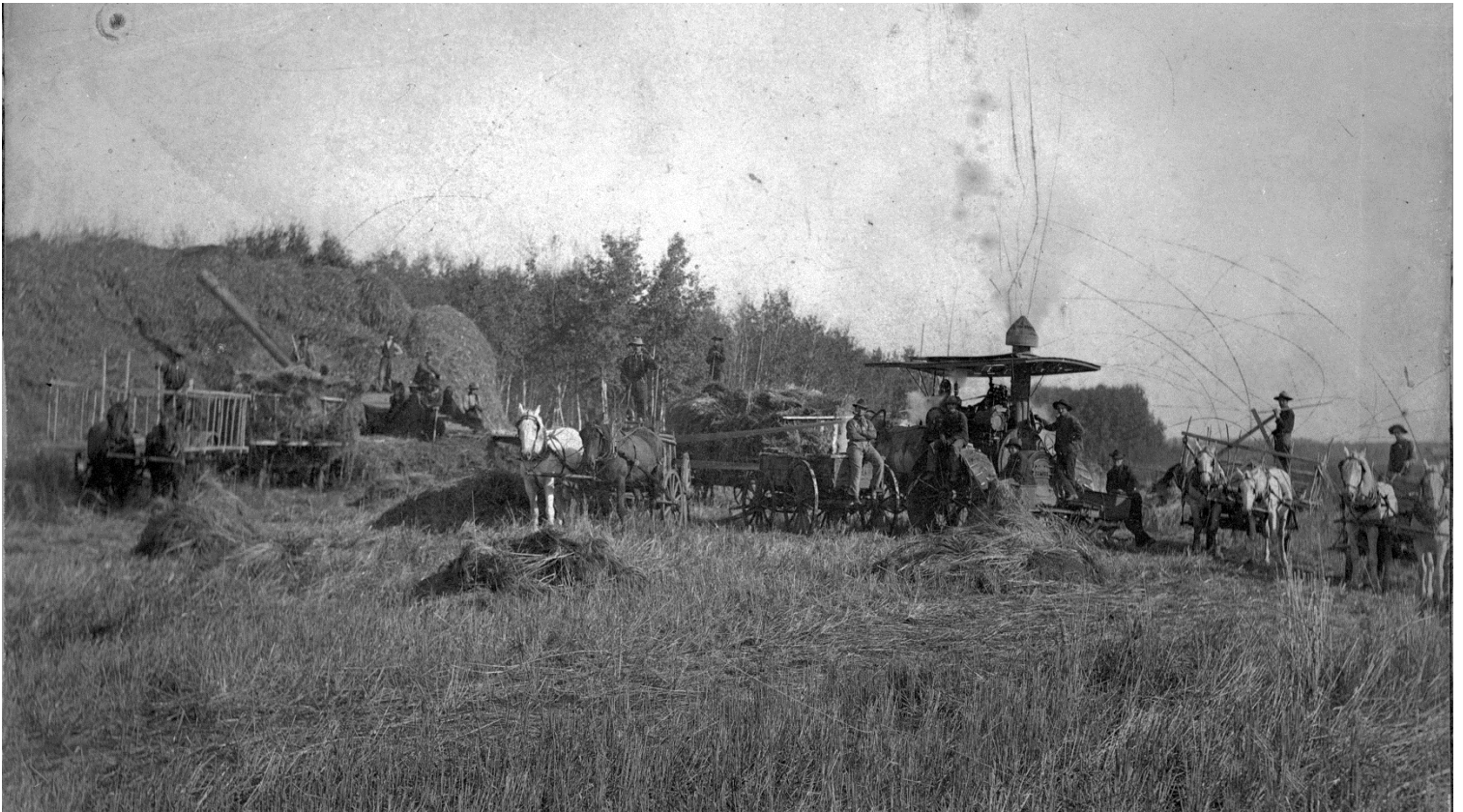
Figure 5 - L'équipe de battage des Lamoureux, 1905 (APA, A2058)